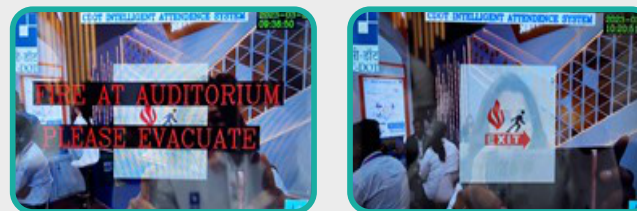
Automatic Alert message