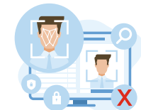
Face spoofing detected